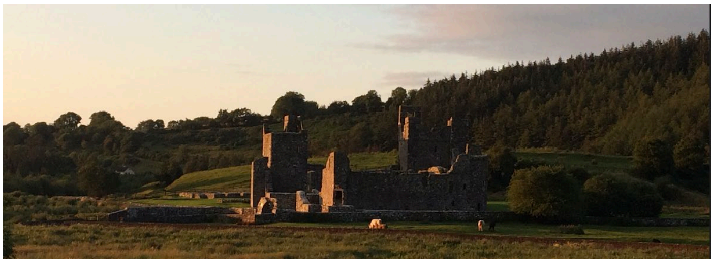
Fore Abbey, Co. Westmeath on a July evening