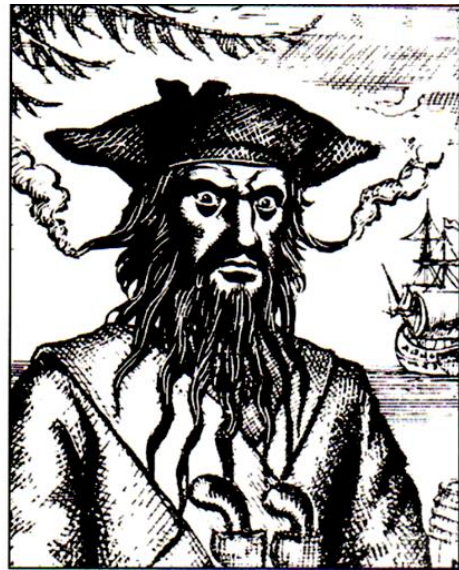
The man himself, late 1710s